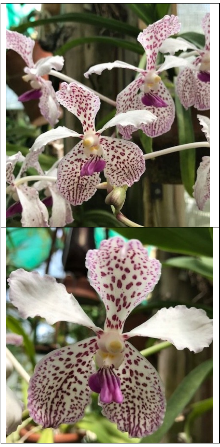
A $7.50 special purchased from Santa Barbara Orchid Estate several years ago as a small seedling - Vanda suavis X Taller Blue. A cool growing vanda that can take summer heat. Grown by Ed Lysek in Templeton