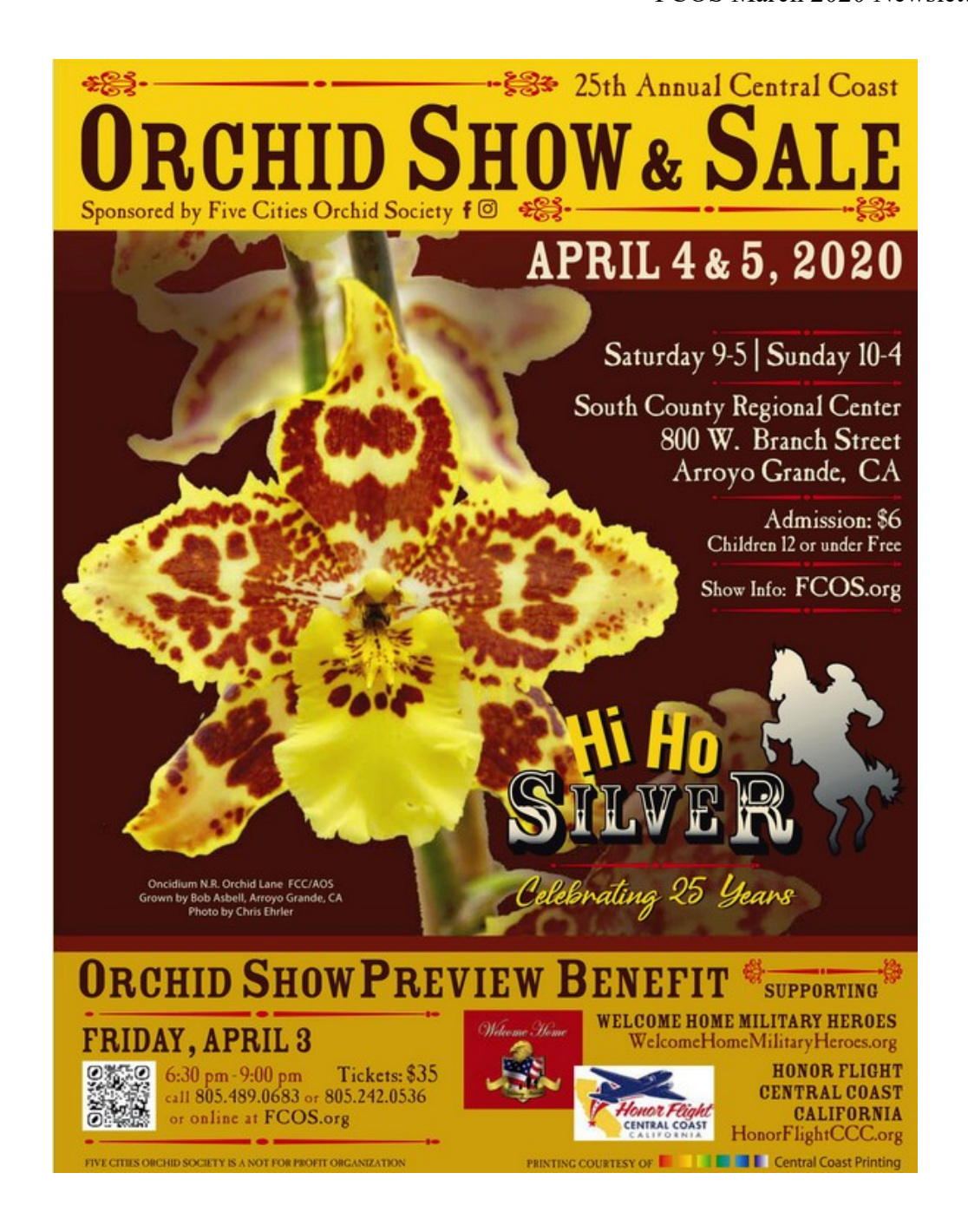
Orchids are really great!

Five Cities Orchid Society, P.O. Box 1066, Grover Beach, CA 93483-1066, USA