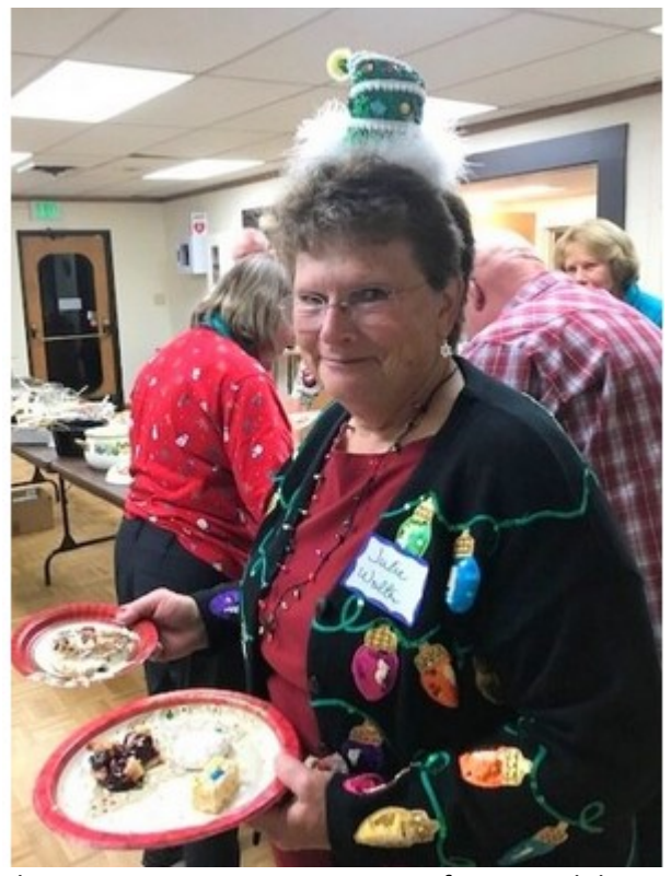
Always great to see everyone in a festive Holiday mood.