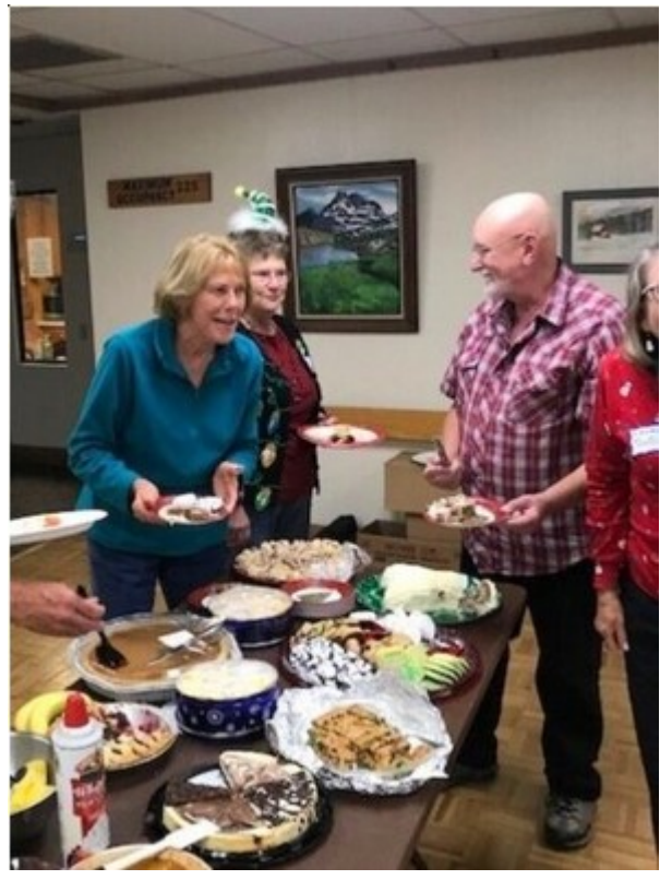
At our December pot luck dinner the desserts were particularly popular.