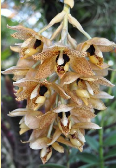
A Stanhopea hybrid