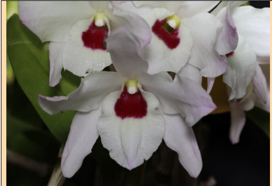
Dendrobium Nagasaki. This is a hybrid between Dendrobium moniliforme and Dendrobium Sagimusume . This orchid is considered to be temperature tolerant so I grow it outside year round in a plastic pot with a combination of classic Orchidata and lava rock. Flower is 2 inches across. Plant received last year from Jeffrey Thompson. Grown by Chris Ehrler