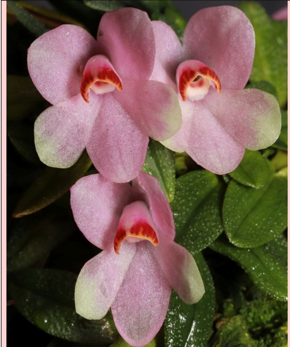
Dendrobium cuthbertsonii bicolor. Native to New Guinea. Needs cool and humid conditions. There are lots of color variations in this species. Grown in the greenhouse year round mounted on a piece of cork bark that is laid flat on the bench. Flower is 1 inch tall. These flowers have been open for over two months and rumor has it that under good culture they can be open for possibly six months. Time will tell how I do. Grown by Chris Ehrler