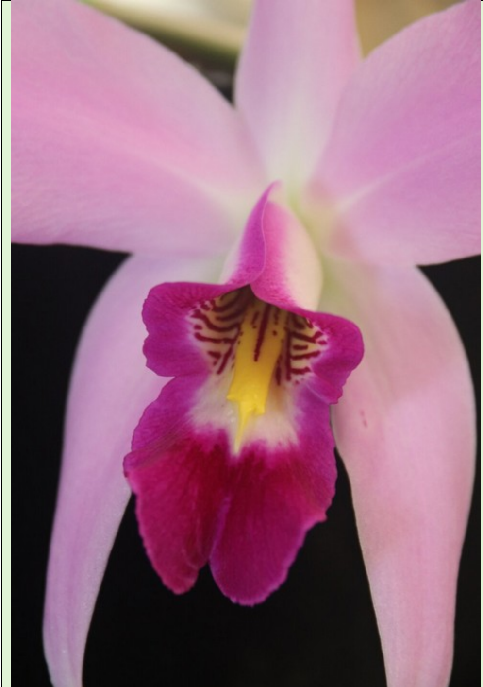
Laelia anceps Mendenhall AM/AOS x Feathered Flame CHS/AOS. Grown in the greenhouse year round mounted on a piece of cork bark. This orchid had one four foot long spike with a total of two flowers. Flower is 5 inches across. Grown by Chris Ehrler