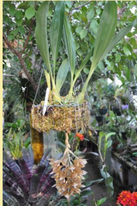
Aciopea 'Ecuagenera Passion' Acineta superba X Stan. stevensonii